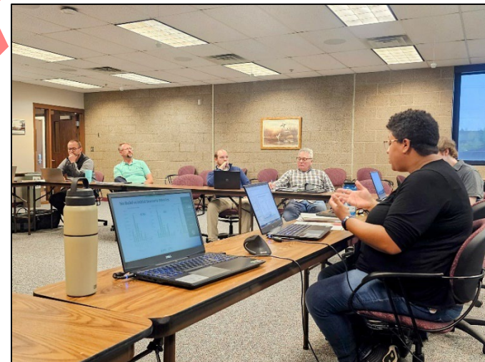
Figure 1.5: Members of the APO’s Technical Advisory Committee listening to a presentation from APO staff.

The APO has six Board-approved staff positions, but as of the publishing of this document, the APO employs four full-time staffers (the Executive Director, the Senior Transportation Planner, the Associate Transportation Planner, and the Transportation Planning Technician) and one part-time employee (the Administrative Assistant).