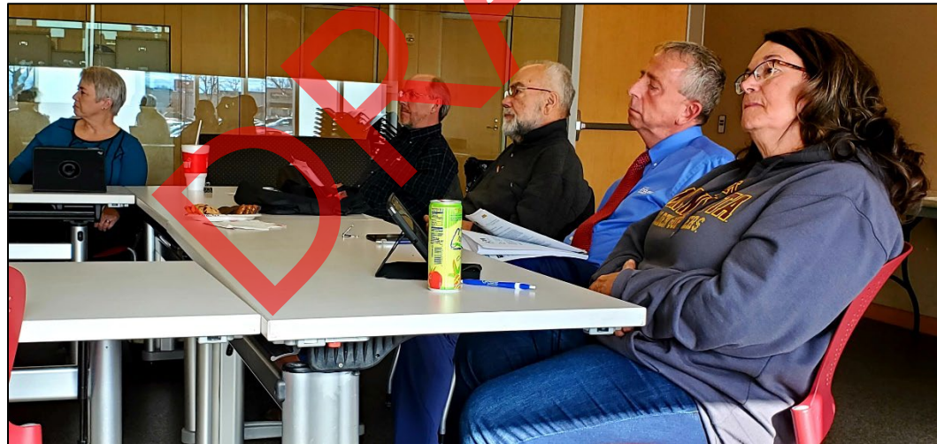
Figure 1.3: Members of the APO's Policy Board listening to a presentation at a Policy Board meeting.

Today, the APO is an association of townships, cities, and counties in the Saint Cloud urban area. The decision-making body of the APO is the Policy Board, which is comprised of elected officials from nine local government jurisdictions as well as a senior executive leader from the Saint Cloud Metropolitan Transit Commission (more commonly known as Metro Bus). Local government membership is comprised of three counties (Benton, Sherburne, and Stearns), five cities (Saint Cloud, Saint Joseph, Sartell, Sauk Rapids, and Waite Park), and one township (LeSauk). The township of Brockway, Haven, Minden, Saint Joseph, Saint Wendel, Sauk Rapids, and Watab as well as the cities of Rockville, Saint Augusta, and Saint Stephen – which are located within the designated APO planning boundary – choose not to participate as voting members on the APO Policy Board. Instead, these non-member jurisdictions are represented through their respective counties. The Policy Board is responsible for adopting regional transportation plans, projects, and policies as well as providing direction to APO staffers. All member units of government are represented by a single voting seat on the Policy Board except for the City of Saint Cloud which has three.